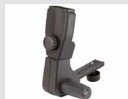
P5 Contatto permanente con sistema regolazione schienale grigio. Permanet contact with adjustment sistem of backrest. Available in grey version.