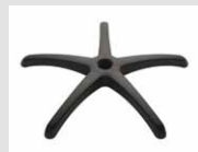
13 Base arcuata in nylon. Arched base made of nylon.