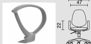
FD Bracciolo fisso in nylon. Fixed Polypropylene armrest.