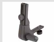
P1 Contatto permanente con sistema regolazione schienale nero. Permanet contact with adjustment system of backrest. Available in black version.