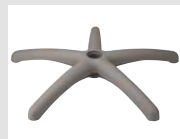
15 Base arcuata in nylon grigio. Arched base made of grey nylon.