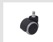
W2 Ruota gommata autofrenante con battistrada morbido Ø50. Self-braking rubber castor with soft tread Ø50.