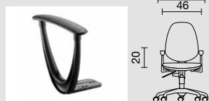
FA Bracciolo fisso in PP e Nylon nero. Fixed polypropylene armrest and fixed nylon armrest - black.