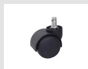
H2 Ruota in nylon nera autofrenante con battistrada duro Ø50. Self-braking black nylon castor with hard tread Ø50.