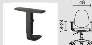
RA Bracciolo regolabile in altezza in nylon nero. Height-adjustable armrest made of black nylon.