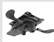
S1 Meccanismo synchron con 4 posizioni di blocco. Synchron mechanism with 4 blocking positions.